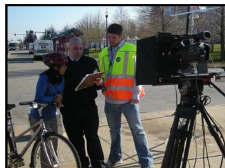
FILMING NARRATION FOR CTA

Chicago Police Department (CPD) and the CDOT Bicycle Program partnered to create a training video for police officers about bicycle related traffic laws. The video covers new bike-related traffic laws established in 2008, drivers' and bicyclists' responsibilities on the road, and how to report bicycle crashes. CPD plays to video for officers during roll call.