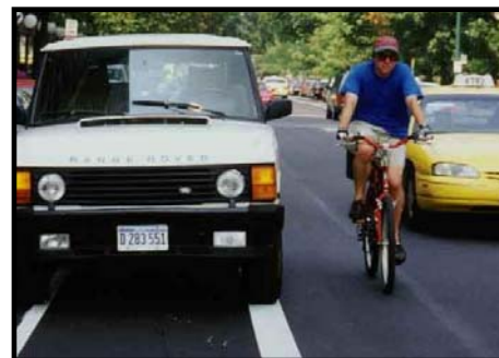
BIKE LANE PARKING VIOLATION