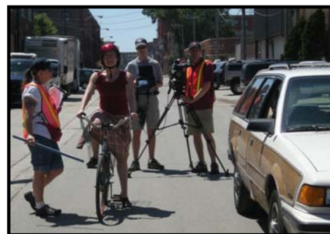
3 FOOT PASSING DEMO FOR CPD VIDEO

Chicago Department of Revenue (DOR) is responsible for enforcing Chicago's bike lane parking ordinance. Vehicles parked in bike lanes endanger cyclists by forcing them to merge with motorized traffic. The CDOT Bicycle Program has partnered with DOR to ensure that all Parking Enforcement Aides are trained to enforce this ordinance. The fine for parking or idling in a bike lane is currently $150.00.